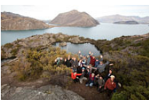
Mou Waho Planting Day - May 2010