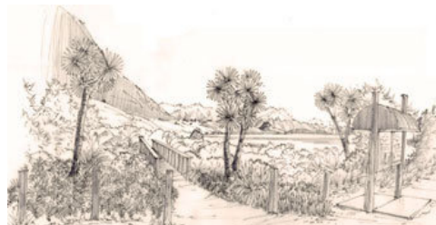
Sketch Concept for Track Head (Millennium Walkway) looking northwest to lake and mountains

Planting activity is in full swing this winter season in our bid to restore the native habitat in the Waterfall Creek/Millennium Track area. This project is the Trust’s first major native habitat restoration project with support from the Ministry of Environment and aims to reintroduce indigenous species into the Waterfall Creek riparian zone. Hundreds of native plants, carefully raised at our nursery from eco-sourced local seeds and cuttings, have been planted in the area thanks to efforts from the Trust and our wonderful volunteers. Three planting days held in June and July saw about 400 native plants go into the ground, starting at Fossil Creek, then along the Millennium track and most recently at Waterfall Creek grove. The planting days have attracted teams of volunteers from all walks of life and nationalities, which contributed to an awesome community vibe, as everyone was enthusiastic and sincere in making a significant and positive contribution to the long term health of this lakeshore landscape. More planting days are planned for the upcoming months, so check our website for news and come join us!