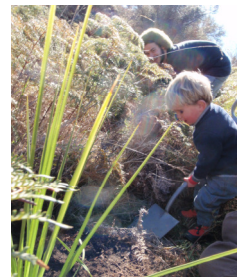
Young Toby happy digging at Waterfall Creek