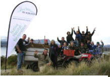
Arbor Day Planting at Fossil Creek - June 2010