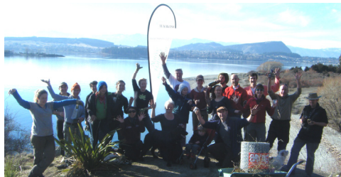
Waterfall Creek Planting Day July 17th