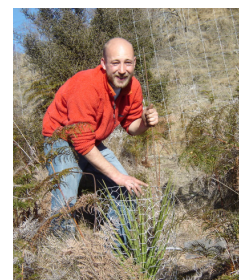
Wire guards are put in to help deter pesky rabbits