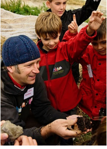
Enviroschool Central Otago Hui - March 2010