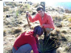
One of many cabbage trees planted