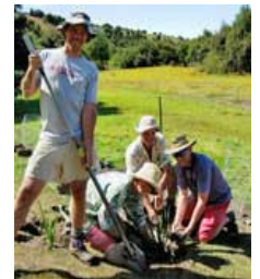
Forest & Bird World Wetlands Day volunteers

Te Kākano supports other local community and not-for-profit groups with eco-sourced native plants for any eligible re-vegetation projects. We’ve planted natives with Central Otago-Lakes Forest & Bird (World Wetlands Day/Butterfields Reserve and Waterfall Creek Track), Mount Aspiring College (350 Planting Day) and the Enviroschools Central Otago Hui. All interested parties can download Application Forms from our website or contact us via email to discuss how we can best help achieve your re-vegetation goals. Our current 2010 Autumn/Spring Plant Stock List includes kanuka, manuka, cabbage tree, kohuhu, kowhai, mingimingi, broadleaf/kapuka, whiteywood/mahoe, marble leaf/putaputaweta, matai, flax/harakeke, hebe/koromiko and lancewood.