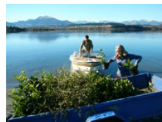
Transporting native plants on Arbor Day